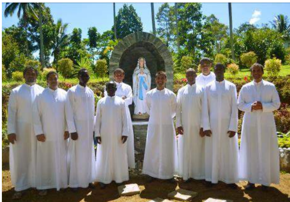
New Marists Profession Day January 2015