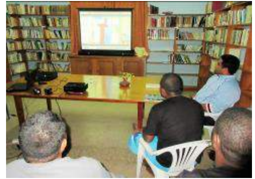
Reviewing a homily